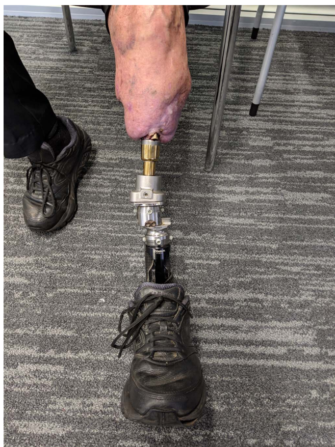
Fig. 3 A clinical photograph of the stump with exposed tibia (Case 1) and artificial limb attached.

contralateral popliteal bypass grafting. Three patients had superficial soft-tissue infections, which were treated with 2 courses of oral antibiotics in 2 cases (Cases 2 and 5) and 1 course of oral antibiotics in the remaining case (Case 6).